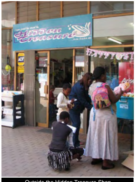
Outside the Hidden Treasure Shop