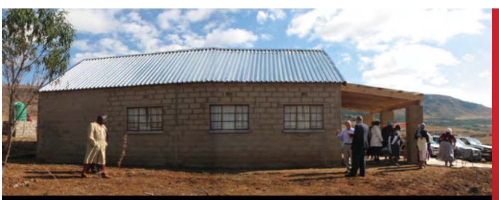
The 12.5m x 7.5m, steel-framed, brick and mortar, building dedicated to the Lord on 11 June 2011