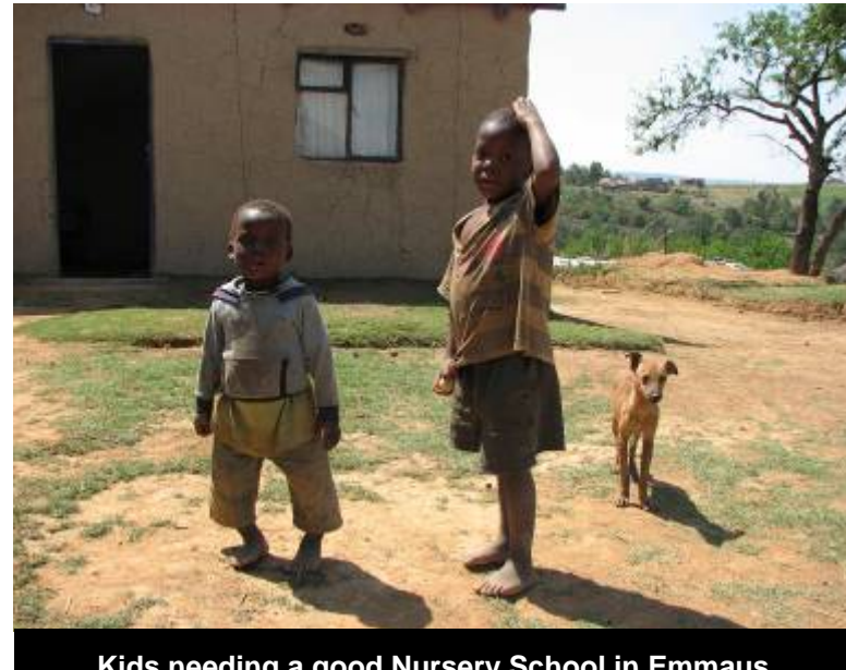
Kids needing a good Nursery School in Emmaus

Don and Cheryl travelled down for the day to do this presentation and it seemed to go very well. We are awaiting further input and feedback from the Okhahlamba municipality but from all appearances at the meeting it seems very promising. Please pray with us that God will continue to open doors as He sees fit. We need teams to come help us build and do outreach in the area – particularly amongst the children and in the schools.